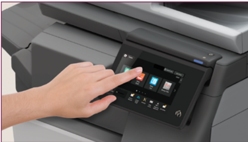
Sharp's award-winning user interface - designed to make life easier.

Our devices feature an LCD touchscreen control panel with Sharp's award-winning Easy UI*, which provides an intuitive display and easy access to commonly used functions. Or you can customise it to suit your own way of working simply by dragging and dropping the menu icons.