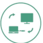
Intuitive Remote Control