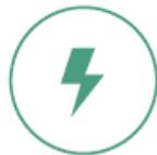
High Security Encryption